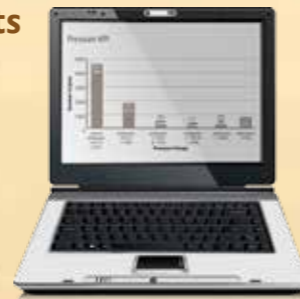
Pressure & Temperature KPI

Your benefits: Maximised tyre life, lower fuel consumption and reduced downtime.